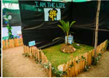
Bom Jesus Somudai