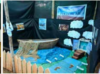
St. John de Facundo Somudai