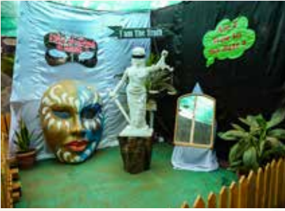
St. Paul Somudai