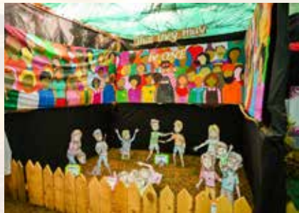
St. Doming Somudai