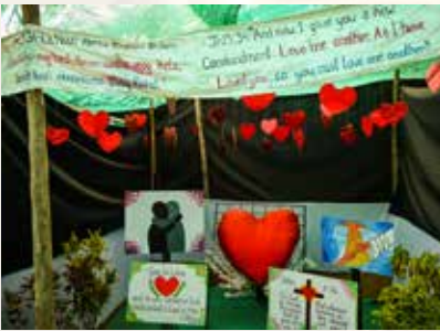
St. Joseph Vaz Somudai