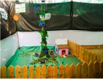
Our Lady of Piety Somudai